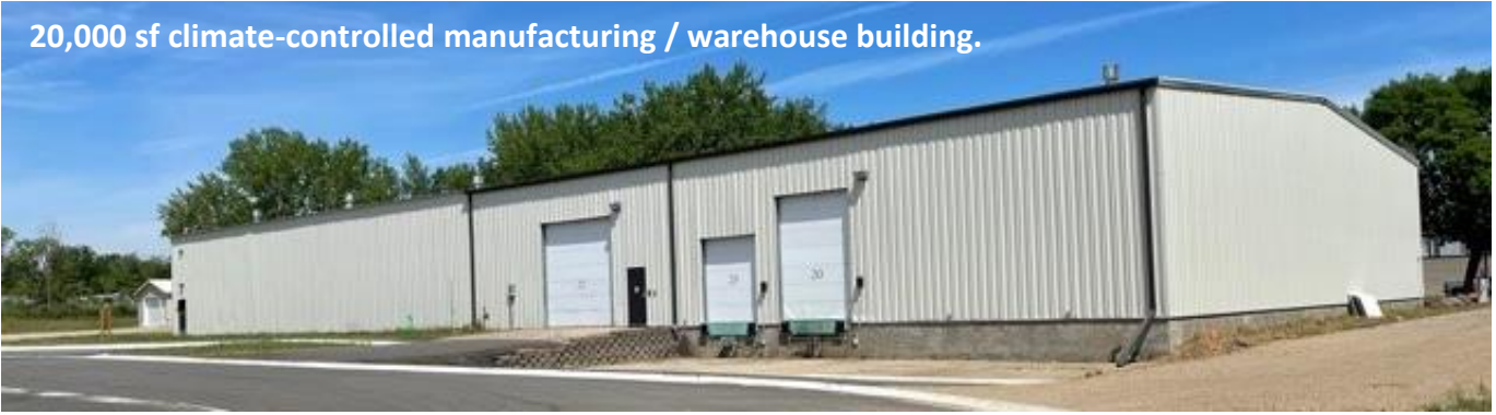
20,000 sf climate-controlled manufacturing / warehouse building.