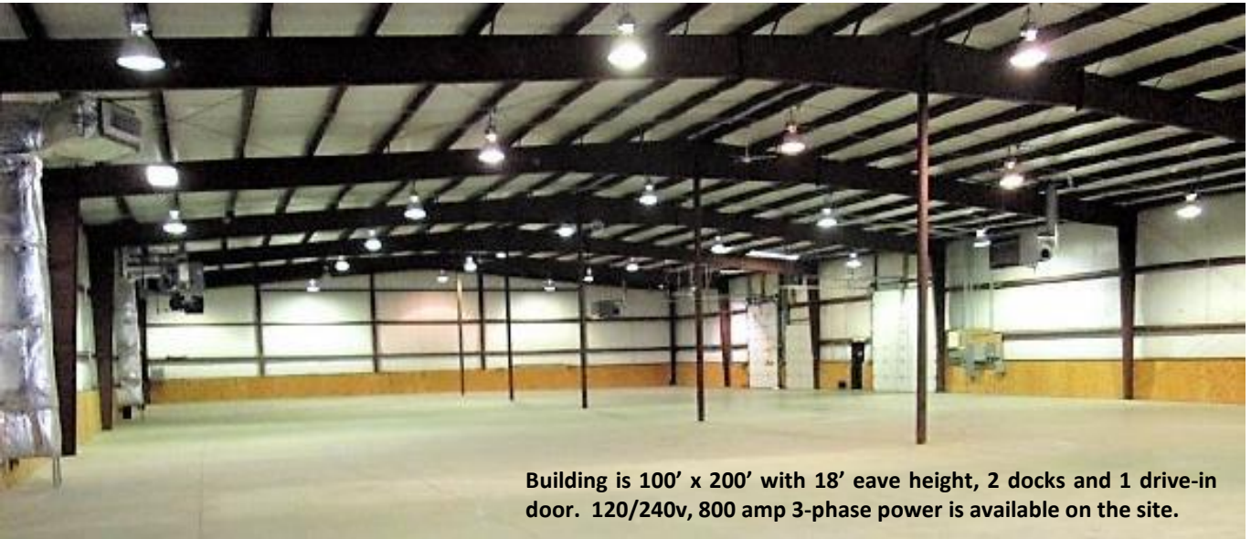
Building is 100' x 200' with 18' eave height, 2 docks and 1 drive-in door. 120/240v, 800 amp 3-phase power is available on the site.