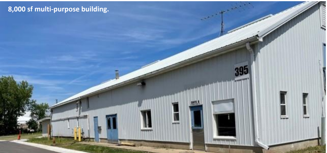
8,000 sf multi-purpose building.