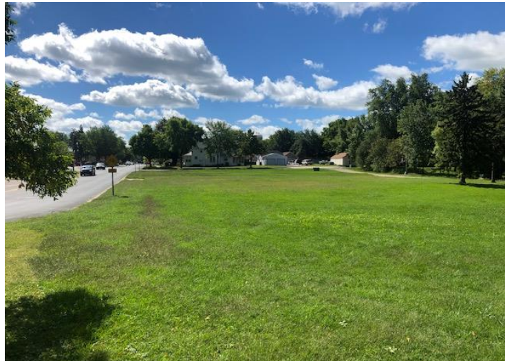
Looking south across the site.

Parks: Eight separate parks are within three city blocks of the site.