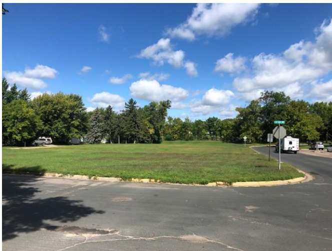
Looking north across the 1-acre site.