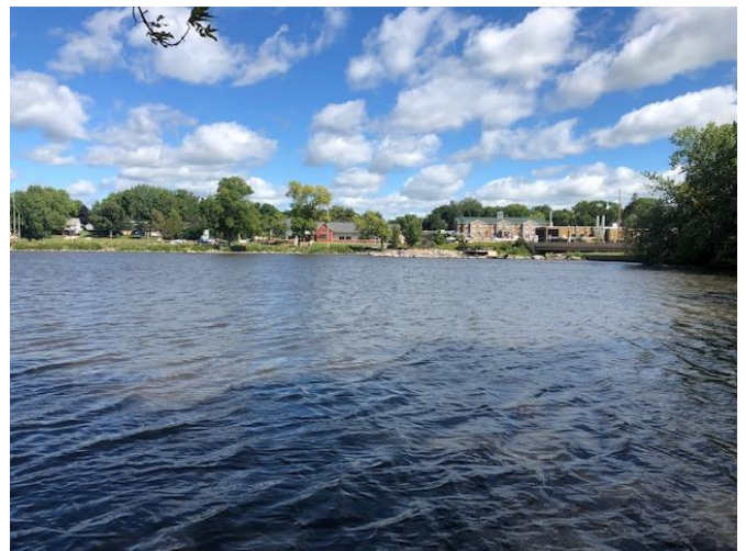
View of the Crow River from the site.