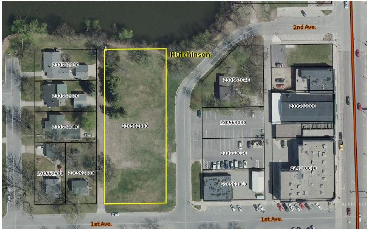
The 1-acre site is one block west of Main Street / State Hwy 15.

Contact: Miles R. Seppelt, Economic Development Director (320) 234-4223 mseppelt@ci.hutchinson.mn.us