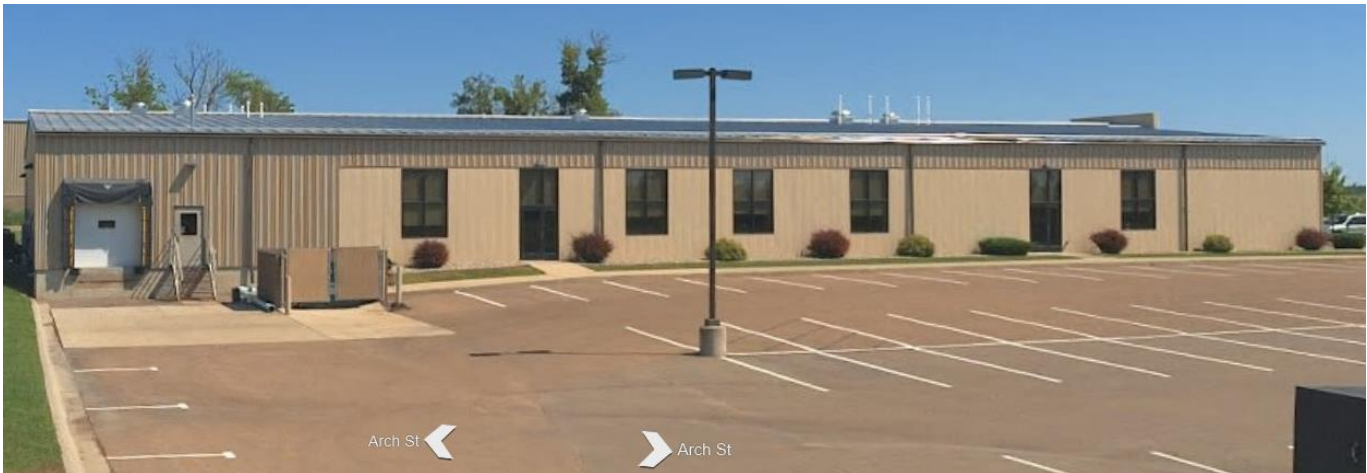
The south half of the building (shown) is available for lease. North half is a call center.