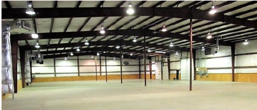
The main building is 100' x 200' with 18' eave height and 2 docks. 120/240v, 800 amp 3-phase power is available in the L-shaped building at left and could easily be extended to the main building.